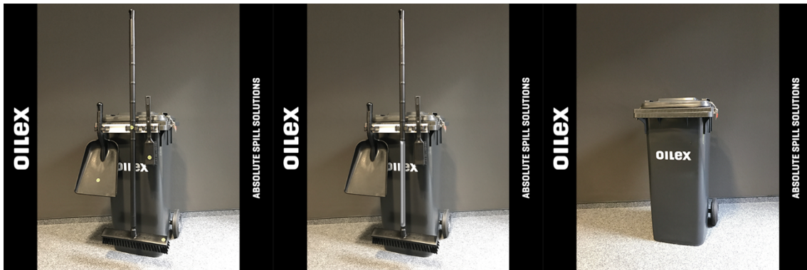
OILEX Spill Kit AS